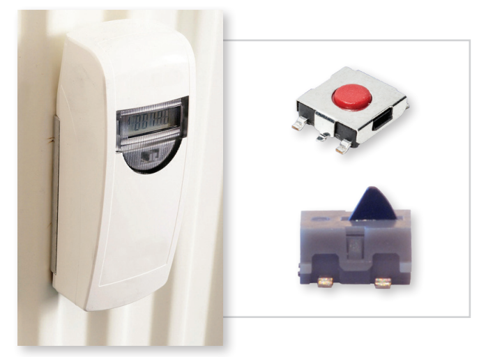
HEAT COST METERS